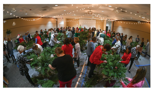
Team members at Wilson Medical Center worked together at the 2022 Holiday Workshop to raise $14,000 for CHEW.