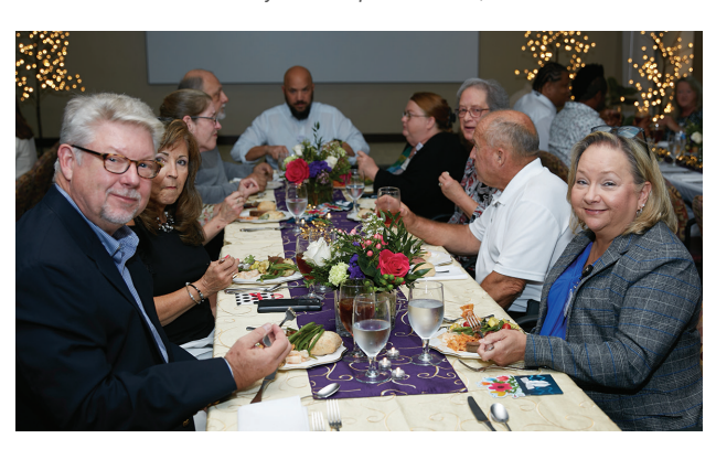
Wilson Medical Center celebrated team members who have at least 35 years of service with an Employee Appreciation Dinner.